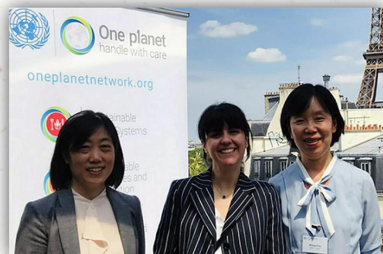
One Planet Network executive meeting