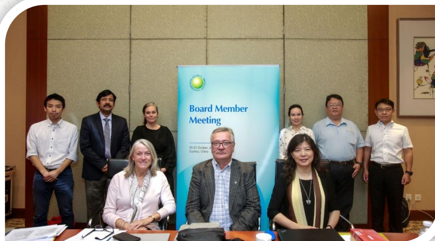
GEN 2019 Autumn Board Meeting, October 20-21, Suzhou, China