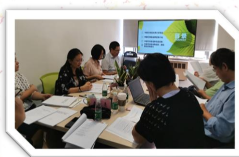
Experts review meeting