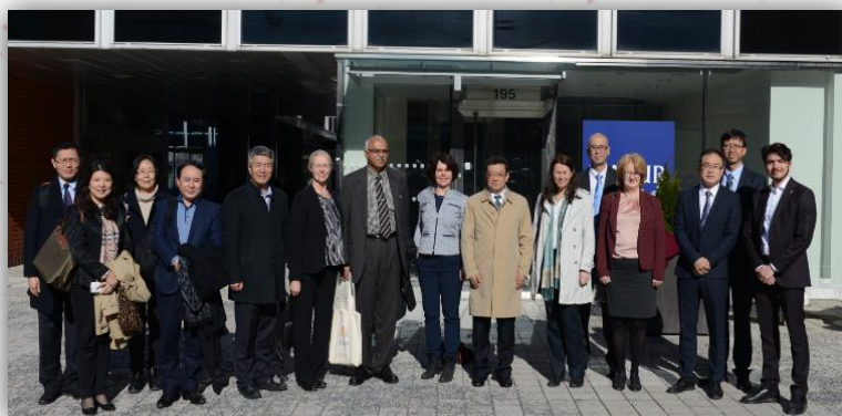
SPS Task Force visited Sweden