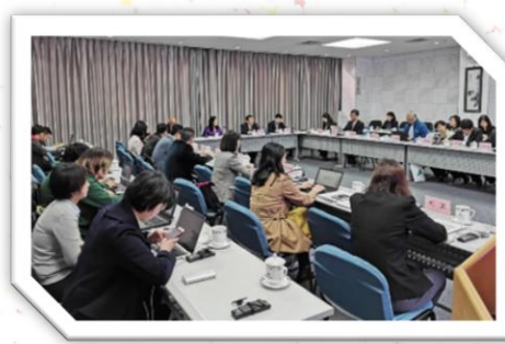
The National High Level Policy Dialogue