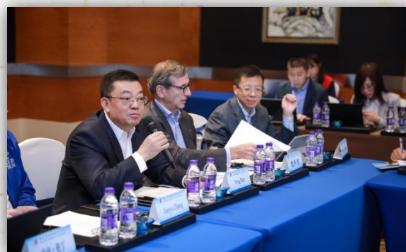
Inception Meeting of Special Policy Study on Green Transition