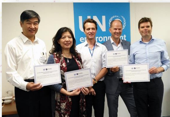
SPP Co-lead Certificate awarding