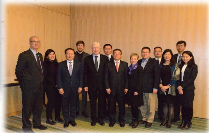
SPS Task Force visited Germany